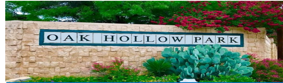
Volume 22 Issue 5, May 2022