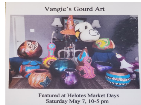
Featured at Helotes Market Days Saturday May 7, 10-5 pm