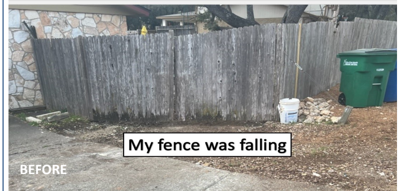
My fence was falling