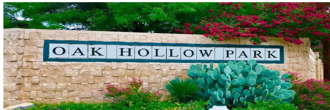
Volume 23 Issue 7, July 2023