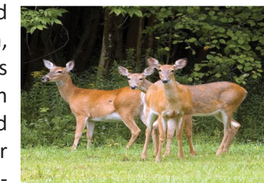
— Kevin Jernigan

Even though the posted speed limit is 30 mph, please remember that is the MAXIMUM. With kids starting school, and deer grazing in our yards, please be considerate of your neighbors and slow down.